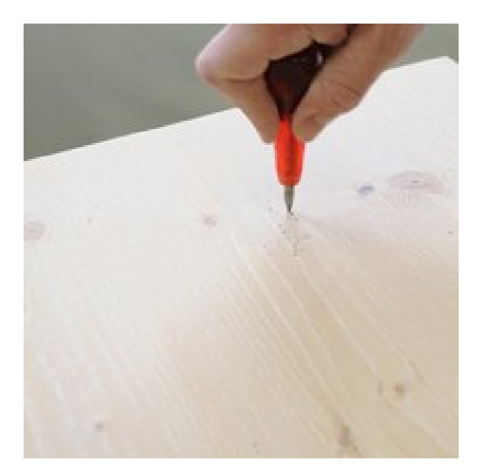
Step 4 - Wormholes

The icing on the cake on the old wood finish are the wormholes: they come off quickly and easily with a flat drill.