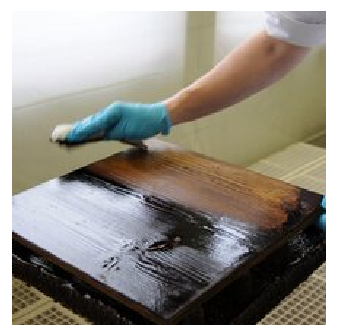
Steps 6 – Washing out

Subsequently, they are washed away with a moist cloth.