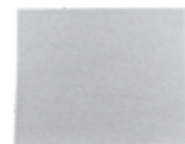
Finishing paper sheet 3M