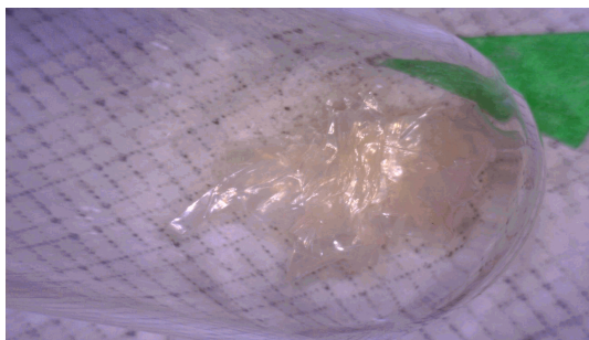
18.3mg analyzed (1mm x 1mm scale)

* ASTM-D6866 cites precision on The Mean Biobased Result as \pm 3\% (absolute). This is the most conservative estimate of error in the measurement of complex biobased containing solids and liquids based on empirical results. Real precision for readily combustible and homogenous materials (e.g. gasoline) and especially samples recieved as CO 2 (e.g. flue gas or CEMS exhaust) can be as low as \pm 0.5\text{-}2\% . The result only applies to the analyzed material. Fluctuations in carbon content within a batch of product, gasoline or flue gas must be determined separately (e.g. averaged measurements of multiple solids or liquids, and single measurement of the combination of gas aliquots collected over time). The accuracy of the result as it applies to the analyzed product, fuel, or flue gas relies upon all the carbon in the analyzed material originating from either recently respired atmospheric carbon dioxide (within the last decade) or fossil carbon (more than 50,000 years old). "Percent biobased" specifically relates % renewable (or fossil) carbon to total carbon, not to total mass or molecular weight. Mean Biobased estimates greater than 100% are assigned a value of 100% for simplification.