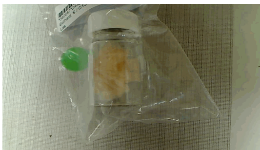
View of content (1mm x 1mm scale)